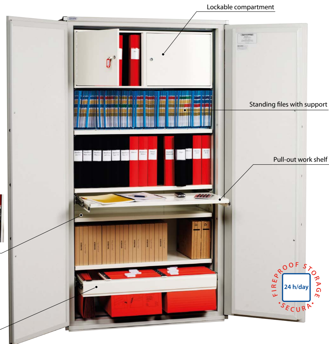
Hanging folder frame