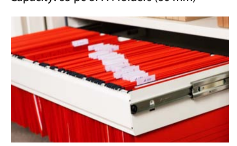
Suspended file frame, capacity: